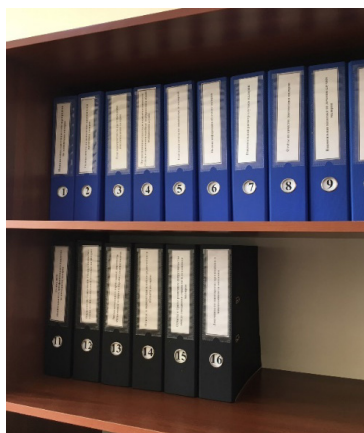
FIGURE 2: Organization of documents and records in folders in Uzbekistan

The minimum requirements for documents and records for certification at different levels of the system and the periods they should cover are summarized in Annex 1 . Some countries organize the documents and records required at the national level into folders to ensure ready retrieval during the independent evaluation mission ( Fig. 2 ). At subnational level, documents and records might not necessarily be organized in folders but should be accessible at subnational health offices, health facilities and laboratories.